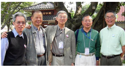
PCCS 50TH REUNION, GUANGZHOU, 2005.